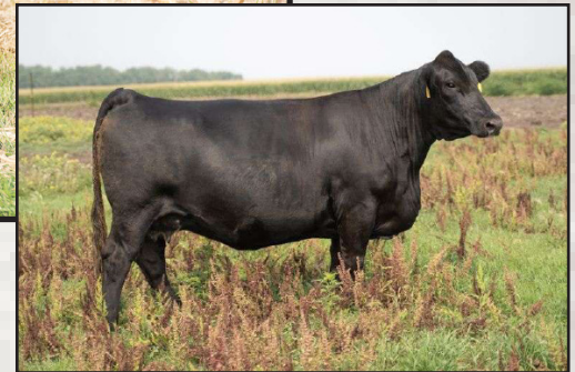
HOOKS EVITA 18E

What an opportunity to purchase a female out of one of the most proven females in the Simmental breed. Hook's Yuma 49Y has produced many of the breed's great herd sires and donor females. Hook's Bounty, CLRS Johnny Walker and Hook's Evita 18E just to name a few. This is truly a proven donor mated to some of the freshest genetics today. We would like to retain 1 flush out of the purchased female at our expense and buyers convenience.