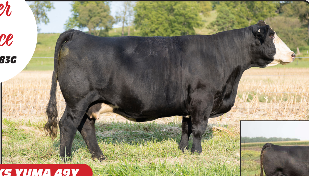
HOOKS YUMA 49Y

What an opportunity to purchase a female out of one of the most proven females in the Simmental breed. Hook's Yuma 49Y has produced many of the breed's great herd sires and donor females. Hook's Bounty, CLRS Johnny Walker and Hook's Evita 18E just to name a few. This is truly a proven donor mated to some of the freshest genetics today. We would like to retain 1 flush out of the purchased female at our expense and buyers convenience.